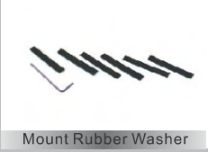
Mount Rubber Washer