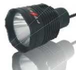
LED Bicycle Lamp