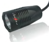
LED Bicycle Lamp