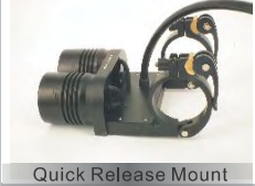
Quick Release Mount